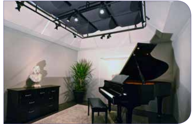
Custom fabric Hemispheres installed at Yellow Hammer Studio - Photo courtesy of Carl Tatz Design

In addition to our standard fire-rated Hemisphere, custom versions are available with added absorption for additional control. Hemispheres are available in their natural textured white finish, which can be painted, and in two fabric finishes to match our ProPanel series.