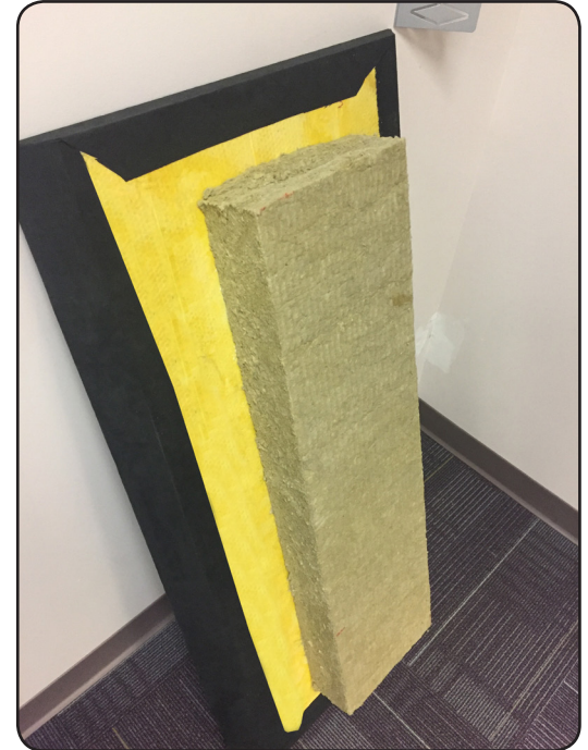
M224 Corner Trap with attached Mineral Fiber Backfill