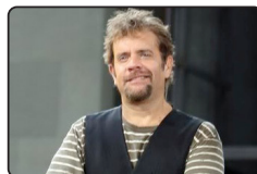
Dane Clark (John Mellencamp)