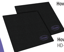
HoverDeck™ v2 HD-22 Panels

HoverMat and HoverDeck v2 users on Stage and in the Studio include: