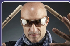
Kenny Aronoff (John Fogerty)