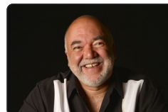
Peter Erskine (Weather Report, Peter Erskine Trio)