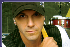
Van Romaine (Enrique Iglesias)