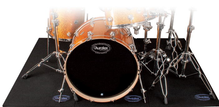
HoverDeck™ v2 HD-22 6-Panel Platform (shown)